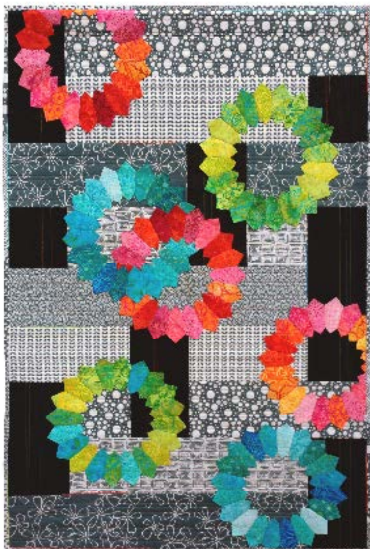
Ringie Dingie | 18" option

Double points put a contemporary spin on this long-time favorite. They also eliminate the need for the traditional appliqued circle in the center of each circle and allow rings to interlock! These Dresdens are built on a foundation so background fabrics don't show through and, more importantly, Dresdens turn out perfectly flat. Learn Susan's tips for speedily turning wedge points with the Prairie Pointer Tool. At home you may finish the quilt by quilting the background then ditch stitching Dresdens onto the quilted quilt! Design possibilities are endless! Finished quilt is 48"x 71".